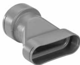
Junction 90/75 to Flat 51