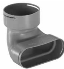
Bend junction 90 to Flat 51

Zehnder ComfoTube meets all the requirements for quick and easy installation. The stable tube (ring stiffness as per DIN EN ISO 9969) is easy to handle, very lightweight and extremely corrosion-resistant. The 100% pure material features a smooth inner surface and optimum tightness, and is also easy to clean. The excellent, tried-and-tested product quality is also indicated by the SKZ seal.