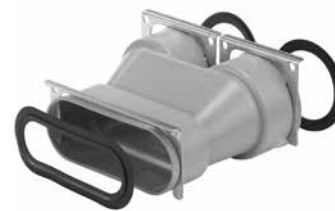
Junction 2x75 to Flat 51