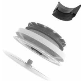
ComfoValve Luna S125, exploded-view drawing