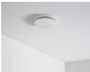
ComfoValve Luna S125, ceiling installation