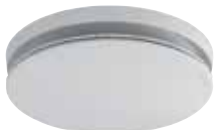
ComfoValve Luna S125