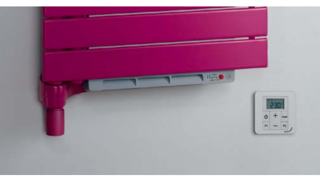
Electric heating fan with timer function and infrared control device