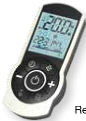
Remote control model 4