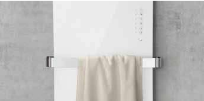
Radiator surface: White gloss