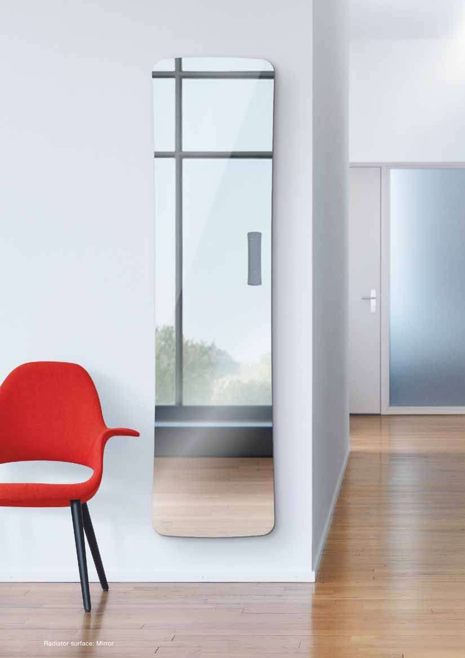
Radiator surface: Mirror