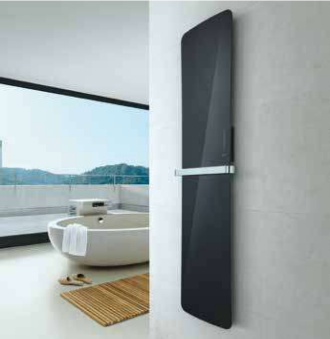
Radiator surface: Black gloss